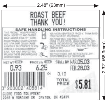
Safe Handling Label (Part E12)