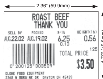
Standard Label (Part E11)