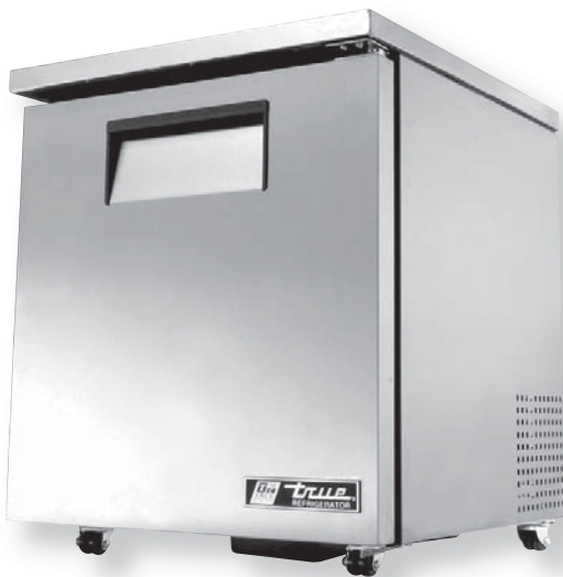
"LP" models feature 1 1 / 2 " diameter, dual swivel castors.