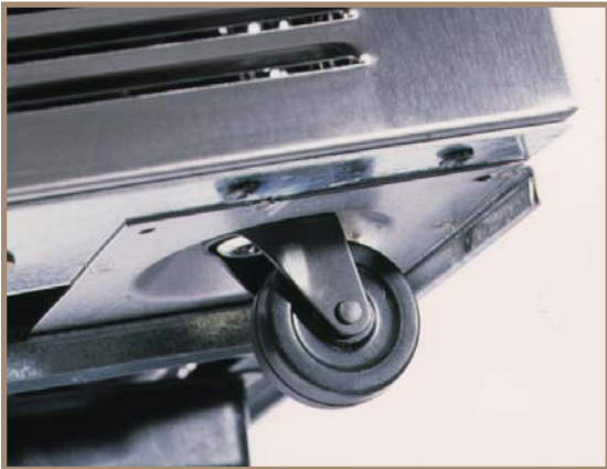
Recessed castor for "LP" models

† Depth does not include 1" for rear bumpers.