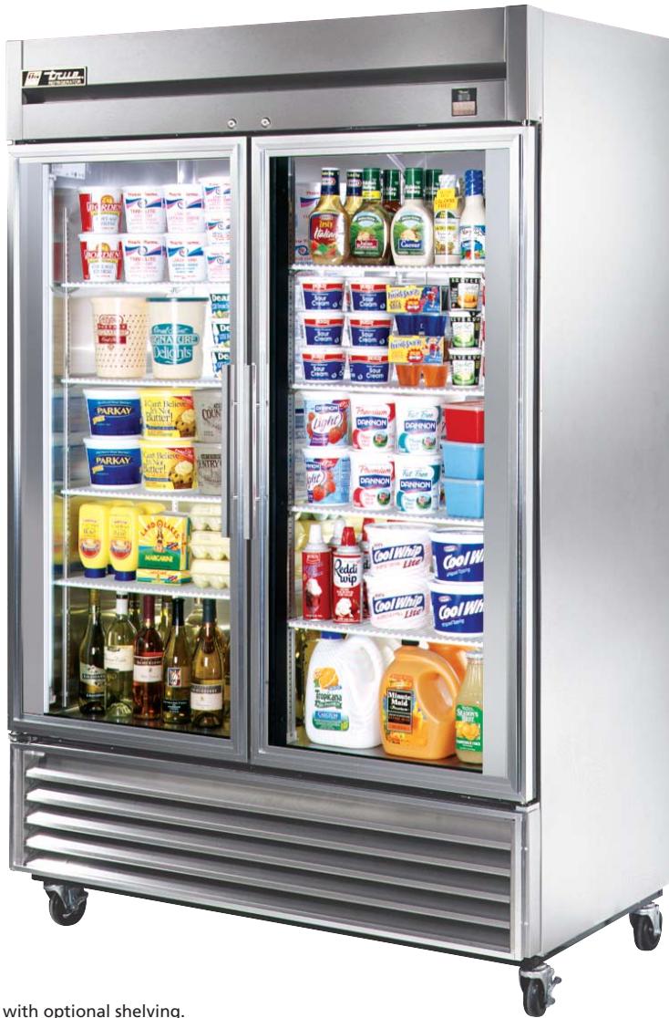
Photo shown with optional shelving.

Reach-In 300 Series Stainless Steel Glass Door Refrigerator