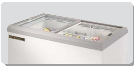
Shown with optional novelty baskets.