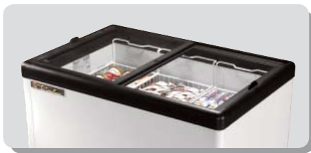
Shown with optional novelty wire baskets.