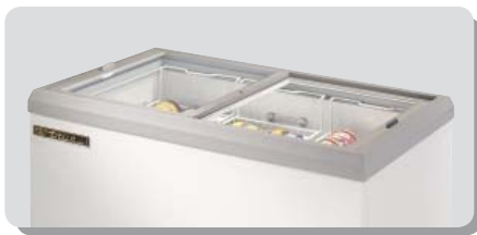
Shown with optional novelty baskets.