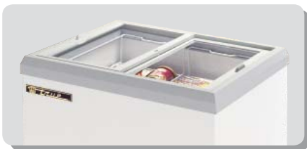
Shown with optional novelty baskets.