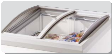
Shown with optional novelty baskets.