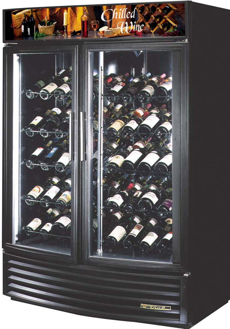
Pictured with two additional (optional) wine racks, in lieu of two standard wire shelves.