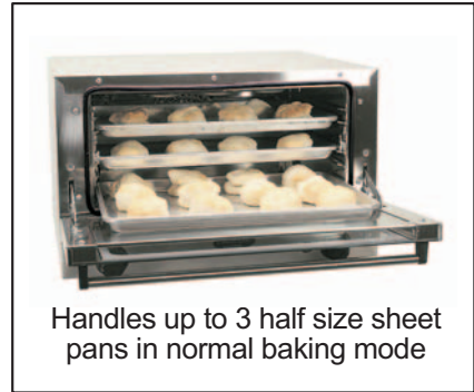
Handles up to 3 half size sheet pans in normal baking mode