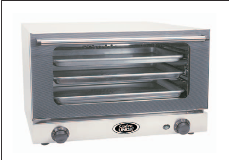
Model OV-350 - Countertop convection oven has 2 modes: regular baking and finishing