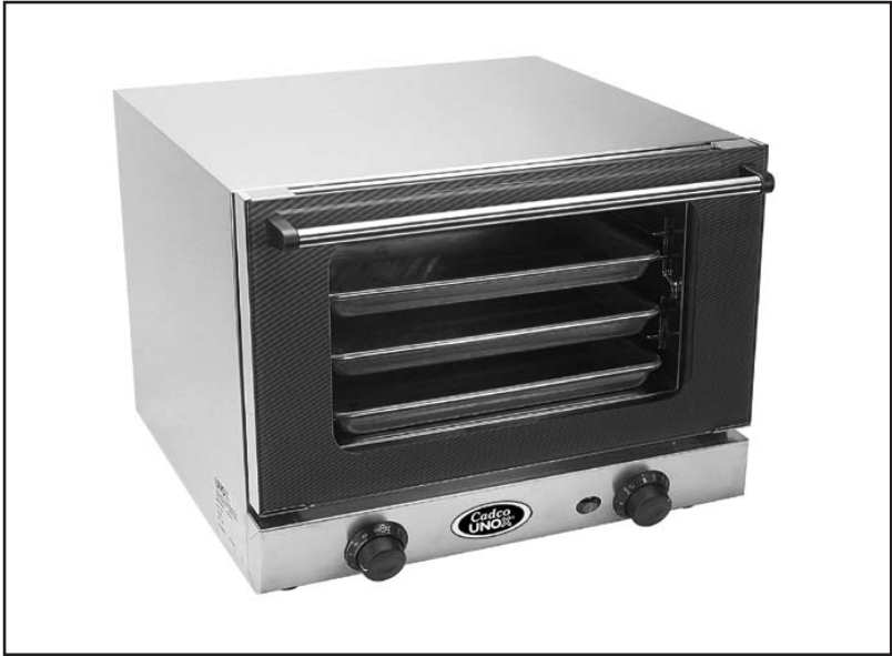
Model OV-250 - Countertop convection oven (Sheet pans not included)