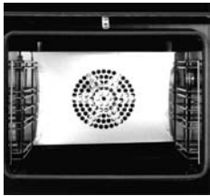
High speed fan for even air distribution