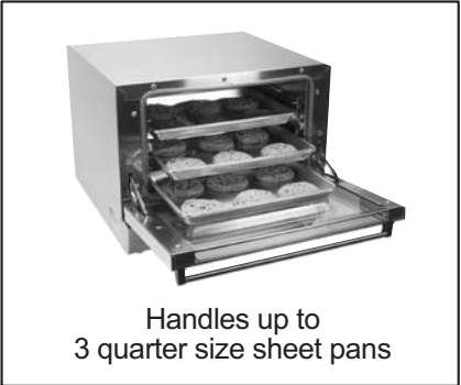
Handles up to 3 quarter size sheet pans