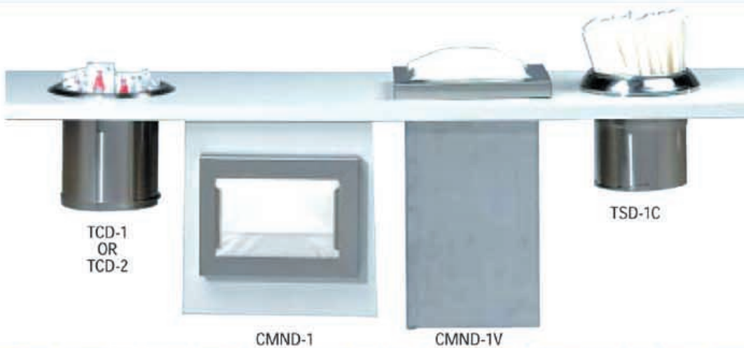
TCD-1 OR TCD-2