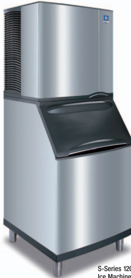
S-Series 1200 Ice Machine on B-570 Bin