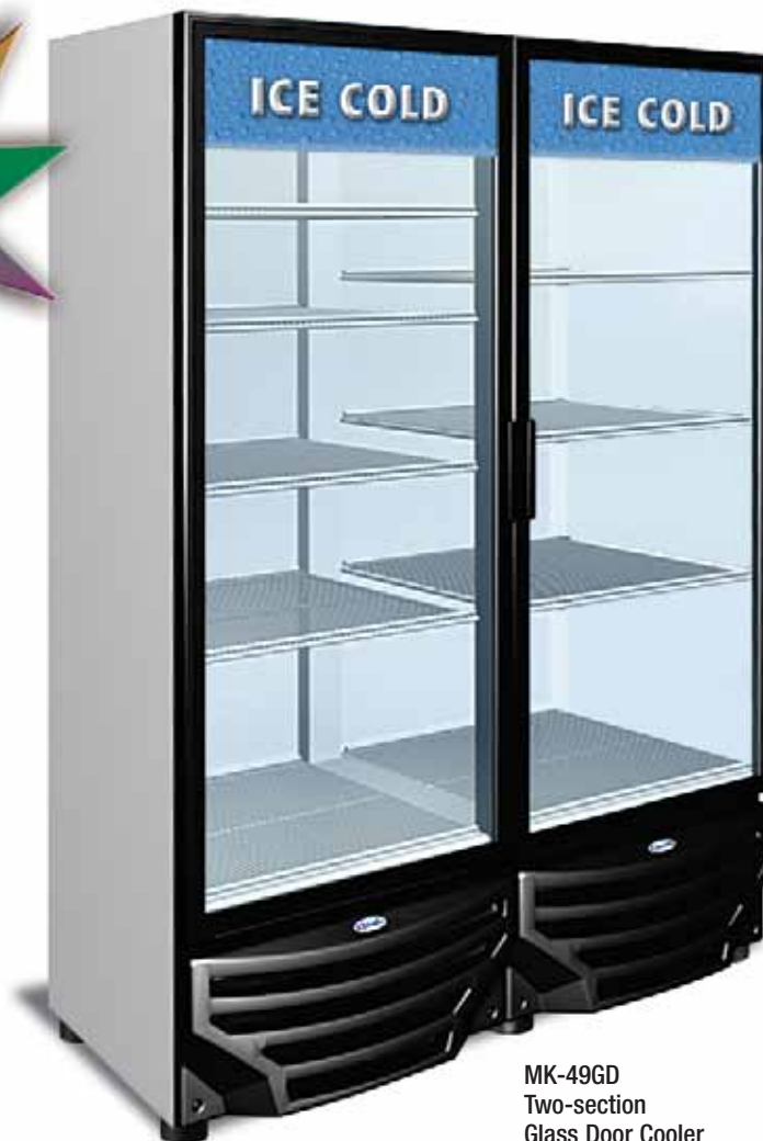
MK-49GD Two-section Glass Door Cooler