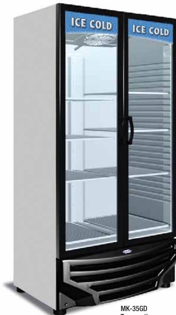
MK-35GD Two-section Glass Door Cooler