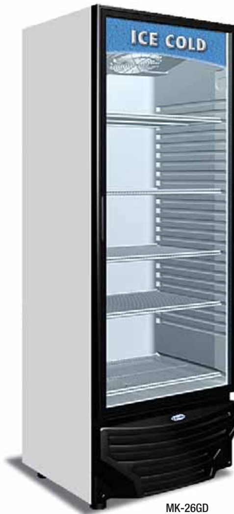
MK-26GD One-section Glass Door Cooler