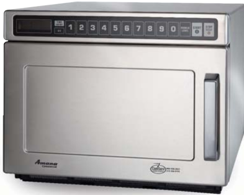
Model HDC18SD shown