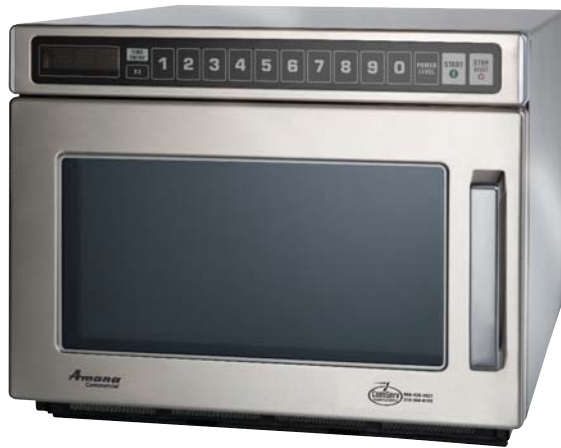
Model HDC182 shown