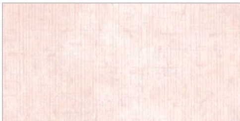
Light Rose (149)

5870 Linen Look Vinyl Tablecloths are available in Light Rose (shown above) and White .