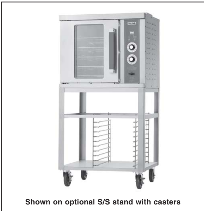
Shown on optional S/S stand with casters