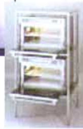
Steaming Rack Available