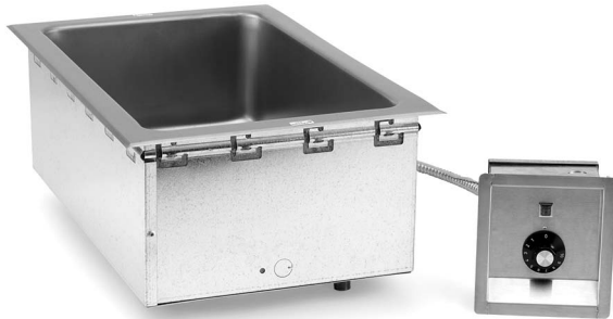
Modular Drop-In: Top Mount Fabricator Well