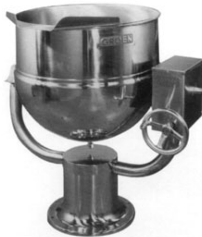
Model D shown

Remote steam source required. Steam trap assembly is required and not provided unless ordered as an option. (See below) See dimension T on other side for steam inlet size and number.