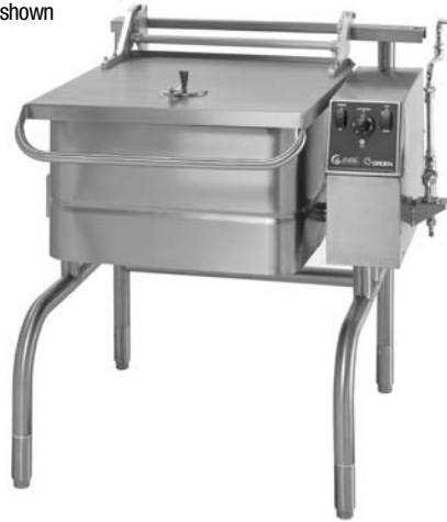
Model BPP-30E shown

A heavy-gauge, fully adjustable one-piece cover is standard with torsion bar type counterbalance designed to maintain selected cover position. A vent is provided in the cover top to regulate condensate buildup and a rear condensate drip shield is located under the cover to prevent condensate from dripping on floor when cover is opened.