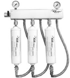
IF3 Water Filter System