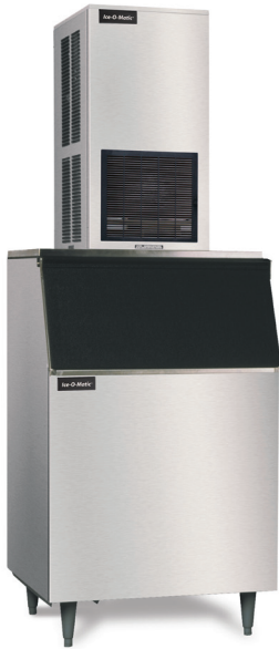
EMF800 on B55