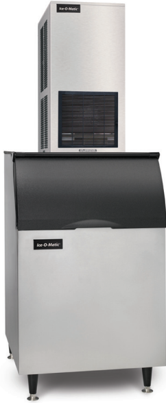
EMF450 on B55