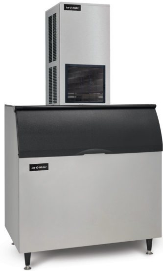
EMF1106 on B100