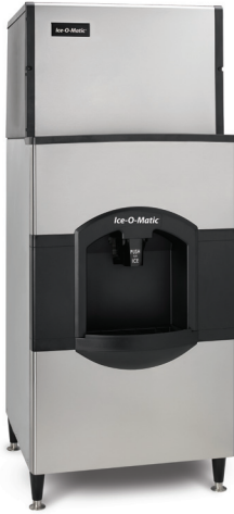
CD40030 with ICE0400