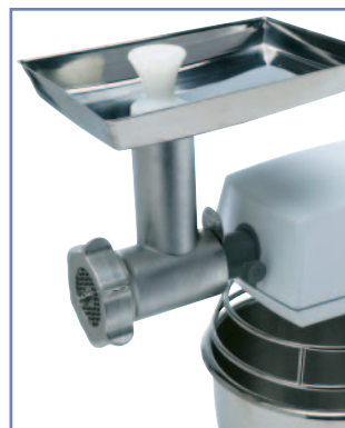
Meat Mincer with 5/32" disc.