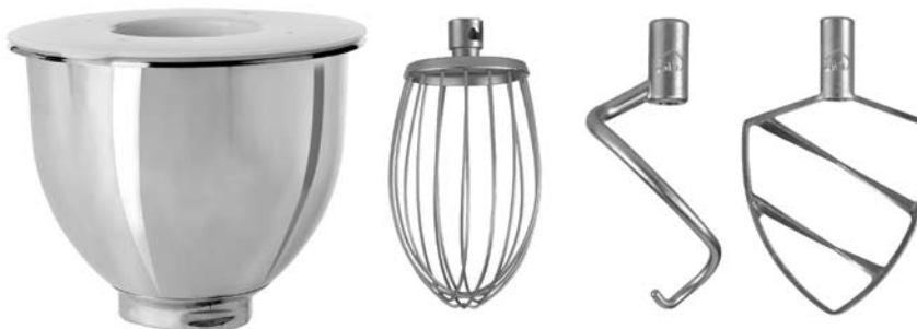
Standard tools: Stainless Steel Wire Whip, hook and beater. Bowl shown with optional plastic Bowl Lid

*On the nominal motor voltage, + or - 10% tolerance is allowed.