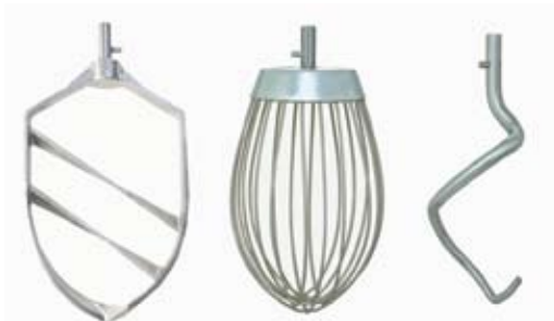
Standard tools: Stainless Steel flat beater, wire whip, and dough hook.