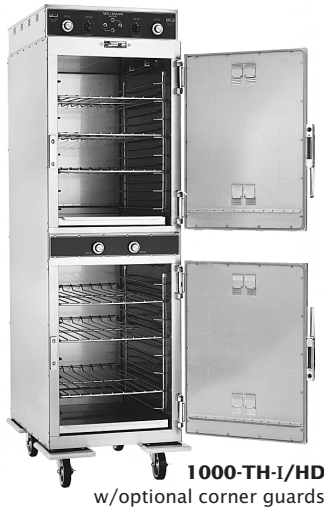
1000-TH-I/HD w/optional corner guards

5-Year Limited Warranty on all cook and hold heating elements (EXCLUDES LABOR).