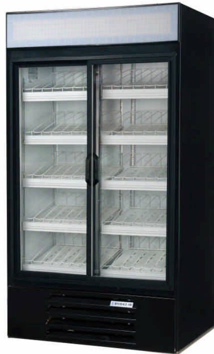
LV38 (shown with optional Gravity Flo Kit and extra shelving)