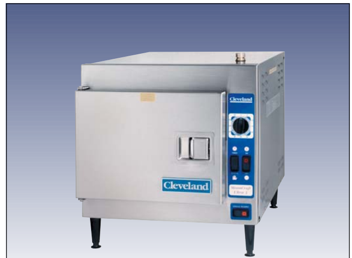
Shown with optional Electronic Timer