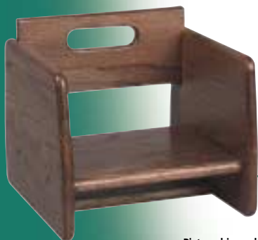
Pictured in walnut finish.