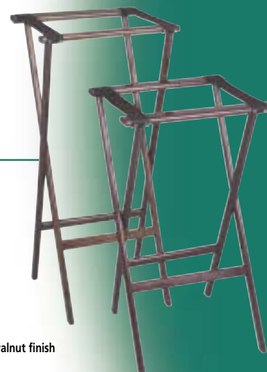
Pictured in walnut finish