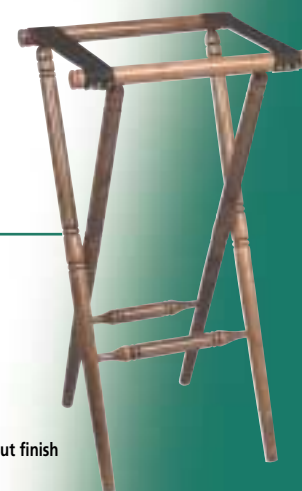
Pictured in walnut finish