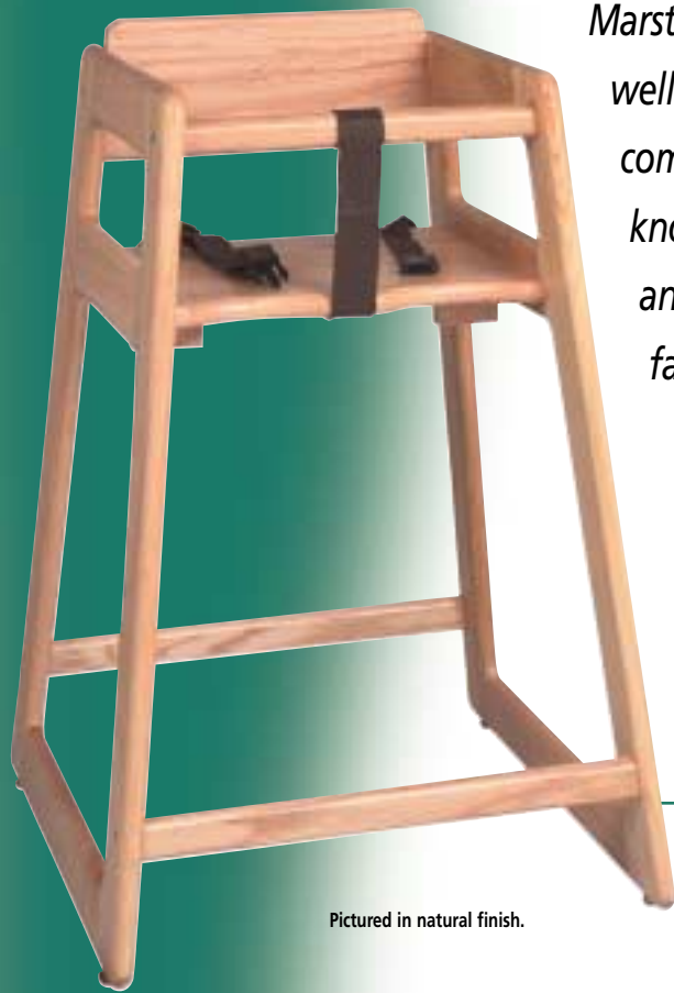
Pictured in natural finish.

Marston Wood Products feature the signature Marston high chairs as well as booster seats, infant carrier holders and tray stands for the commercial foodservice industry. Marston Wood Products are known throughout the industry for their superior construction and quality. Standard stain colors are FDA approved; contact factory for custom colors.