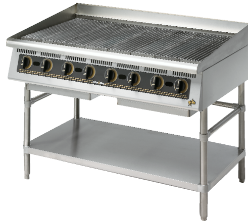
Model 8036CB Shown with Optional Floor Stand