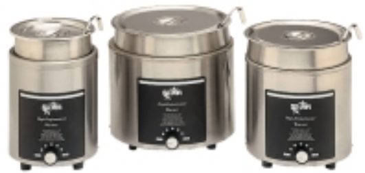
Model 4RW, 11RW & 7RW