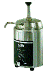
Model 4RW-P Shown with optional bowl, lid and ladle