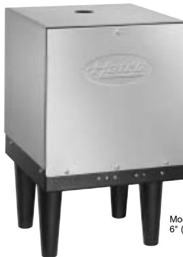
Model MC-10 on 6" (152 mm) legs