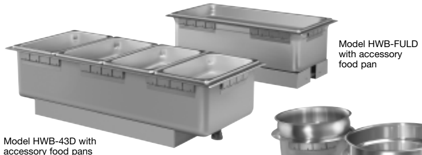
Model HWB-43D with accessory food pans