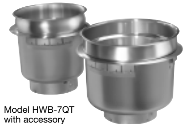
Model HWB-7QT with accessory food pan (notched lid not shown)