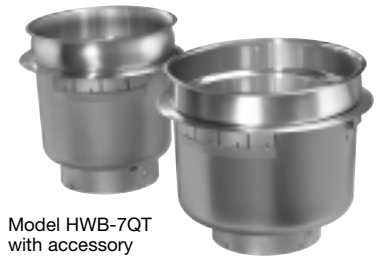
Model HWB-7QT with accessory food pan (notched lid not shown)