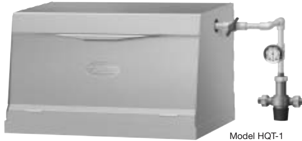
Model HQT-1 Patent Pending