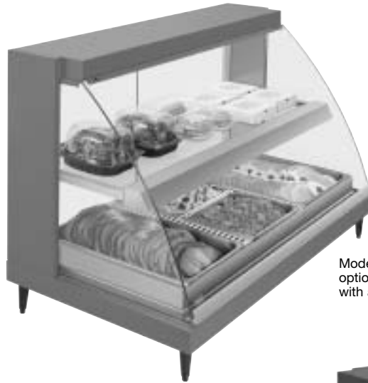
Model GRCDH-3PDG in optional Designer color with accessory pans