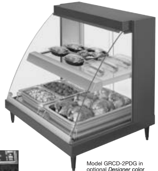
Model GRCD-2PDG in optional Designer color with accessory pans