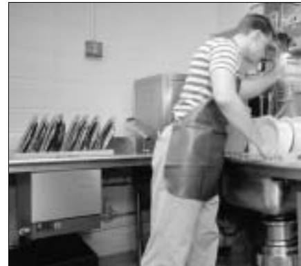
Water Temperature Recovery Table