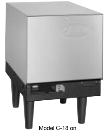
Model C-18 on 6" (152 mm) legs