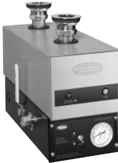
3CS-6 with optional temperature monitor