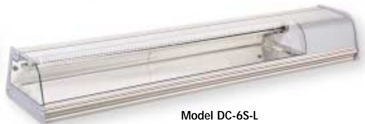
Model DC-6S-L For "L" models, compressor is at the left side when facing controls