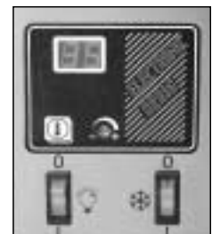
Electronic SMARTEMP adjustable thermostat

WARRANTY: One (1) year parts & labor, two (2) years on the condensor & compressor