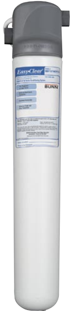
Model EQHP-SFTN Water Quality System