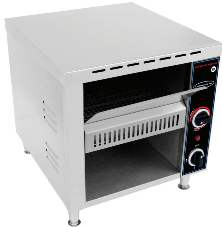
Model: CPCT1 UPC: 814387010206