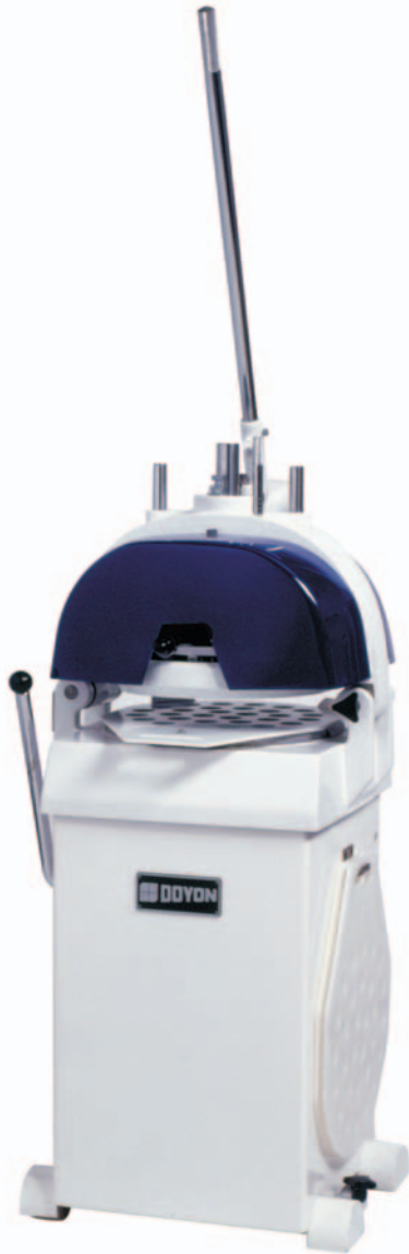
DSF015 - DSF022 - DSF030