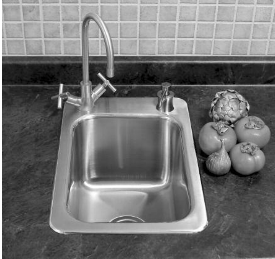
Above Shown with 2 Hole Faucet Modification (TA-472RE)